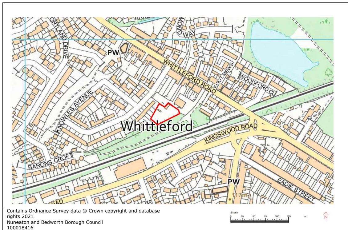
GTS4 – Spinney Lane/Whittleford Road, Nuneaton

4.23 As well as the allocation of sites for new Gypsy and Traveller pitches the Council has considered the ongoing need for a Travelling Showperson’s yard within the Borough, currently at Spinney Lane/Whittleford Road, Nuneaton. This is the only such type of accommodation in Warwickshire and thus has considerable importance to the County as an asset and also by ensuring continuity and availability of these plots within the Borough it contributes towards provision. The issues and options consultation document proposed the safeguarding of the site for its current use given its special status in the County. Comments were sparse on this matter, but no responses were received stating that safeguarding of this site for this purpose was