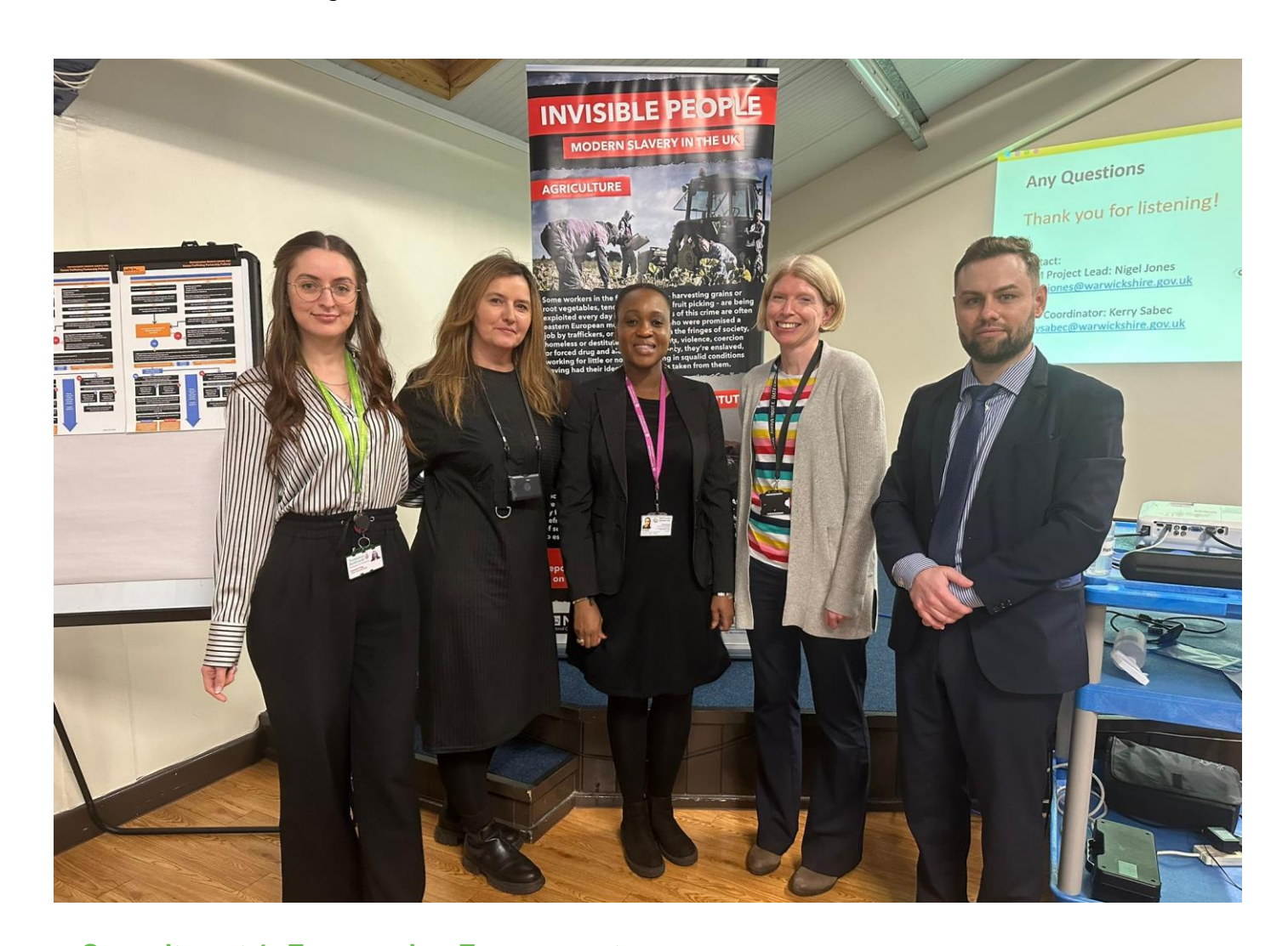
Commitment 1: Empowering Engagement

"Residents to feel safe, empowered, and confident to easily report ASB."