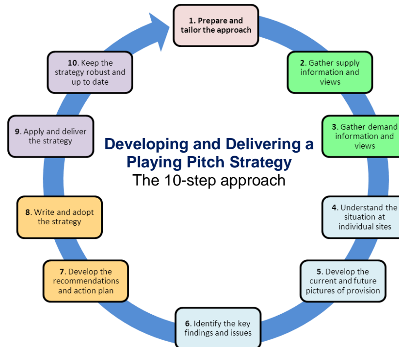
Figure 2: The 10 steps to delivering a Playing Pitch Strategy