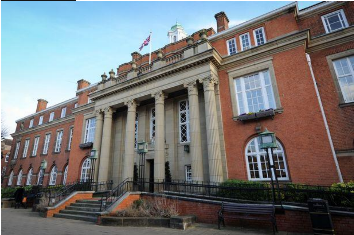
The council has three independently assessed proposed traveller pitches sites